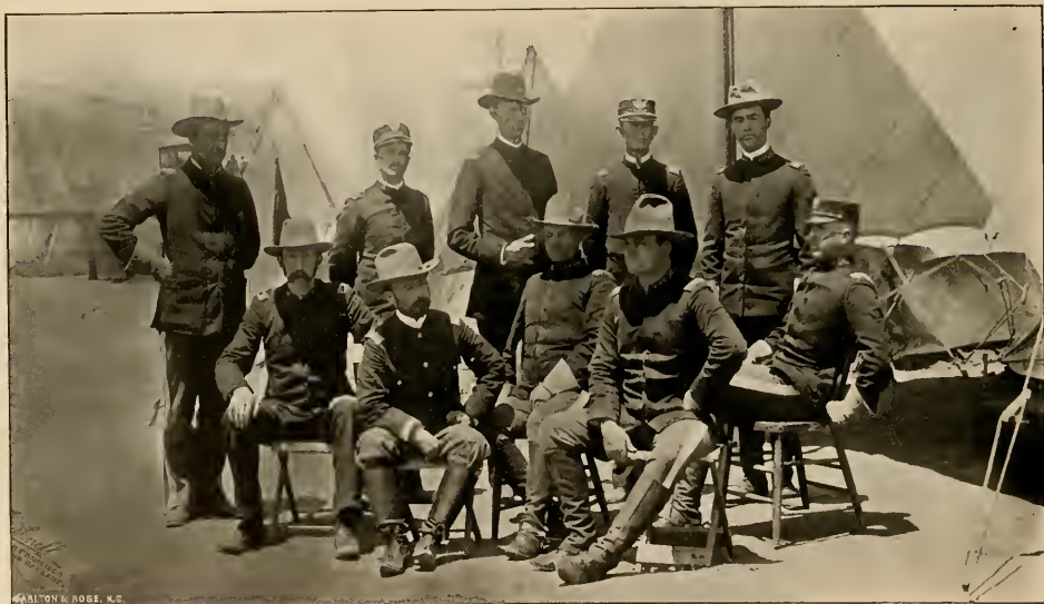
GROUP OF FIELD AND STAFF OFFICERS, BEFORE LEAVING SAN FRANCISCO.